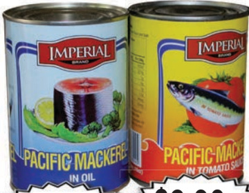
Imperial Mackerel in Oil or Tomato Sauce