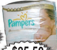
Pampers Nappy Newborn 78s