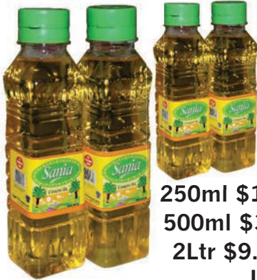
Sania Cooking Oil