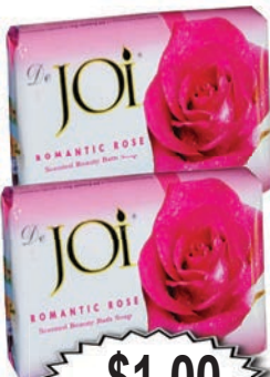
Joi Bath Soap