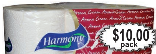
Harmony Toilet Tissue 10pk