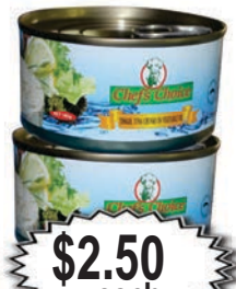
Chef's Tuna in Oil