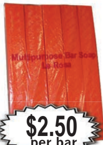
Le Rosa Bar Soap