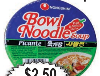
Nongshim Bowl Noodle Soup