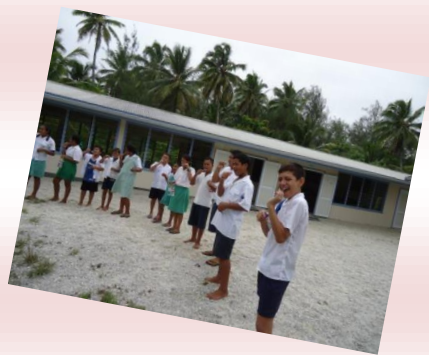
Tamariki Mitiaro te uru nei te nio