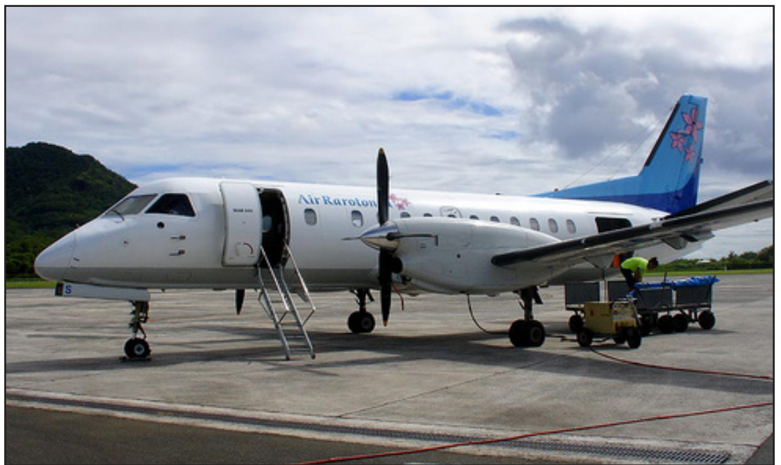
Aitutaki Sunday Flights

Why weren't Smith and Bishop proactive and warn the voters of Aitutaki of these horrendous consequences of banning Sunday flights to their Island? To make these outrages claims the entire economy of the Cook Islands is dependent on a couple of Sunday flights is a desperate