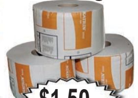
Katrin Toilet Tissue single