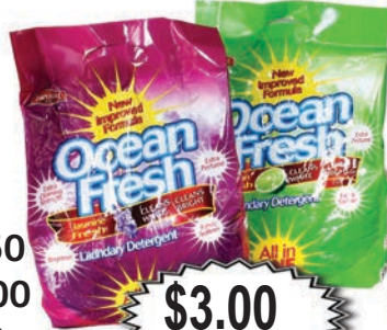
Ocean Fresh Laundry Powder 1kg