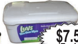
Luv's Baby Wipes 72