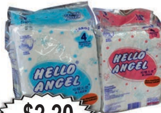
Hello Angel 4 Pack