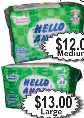
Hello Angel Diapers Medium 28s, Large 24