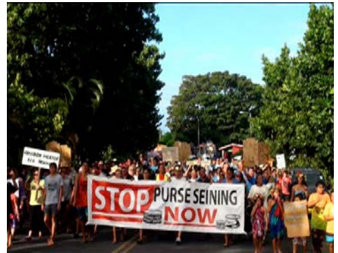
Pictured here 24/4/15 protestors against purse seine fishing

trying to get here is an environmental balance and an economic balance".