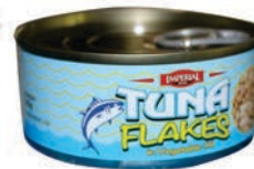
Imperial Tuna Flakes